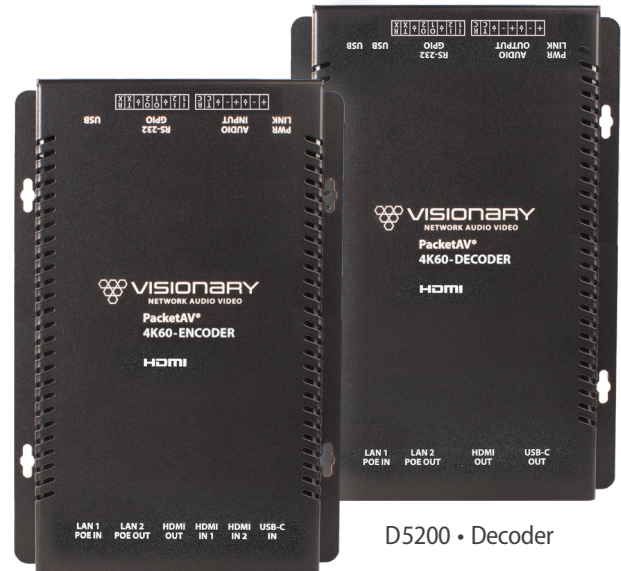
E5200 • Encoder