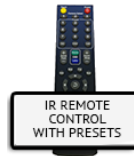
IR REMOTE CONTROL WITH PRESETS

The NTV51SNDI30 offers a wide field of view with the ability to zoom into a narrow 2.34 degrees.